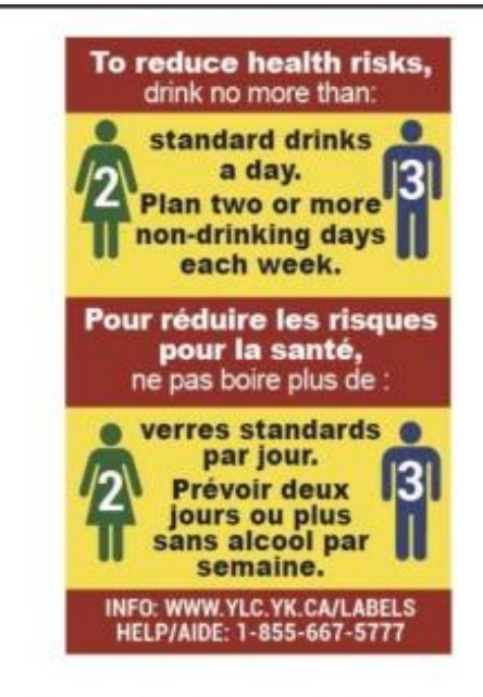
Label 2 – Canada's National Drinking Guidelines