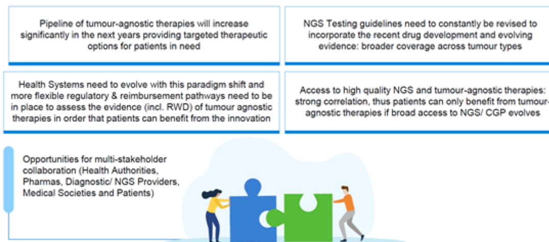
Figure 1. Pharma Perspective: Key Takeaways

Van Buskirk closed with five key take-aways: